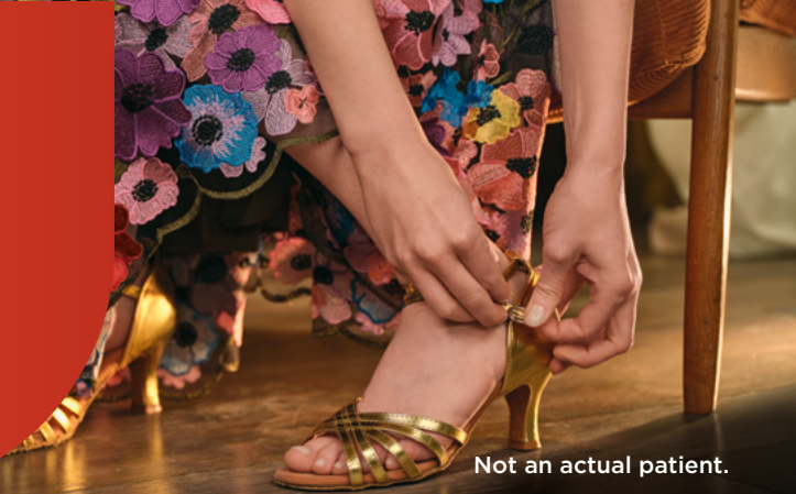
Not an actual patient.

Apply for the KevzaraConnect® Copay Card.