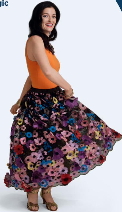
Not an actual patient.

These are not all of the possible side effects of KEVZARA.