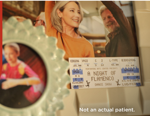
Not an actual patient.

Apply for the KevzaraConnect® Copay Card.