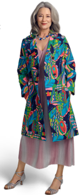
Not an actual patient.